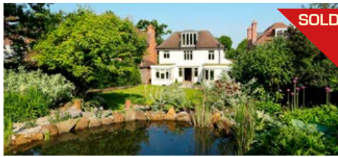
Home Park Road, Wimbledon £3,950,000