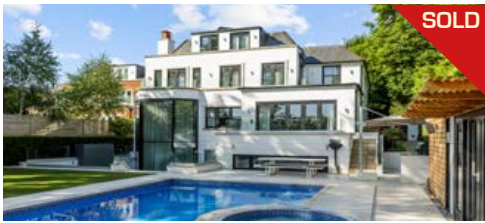
Burghley Road, Wimbledon Village £7,900,000