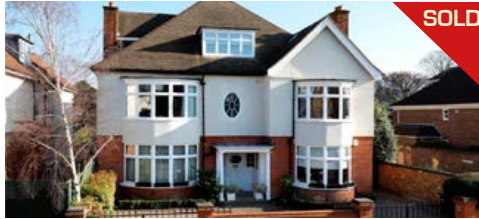
Marryat Road, Wimbledon Village £5,950,000