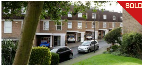
Welford Place, Wimbledon £1,650,000