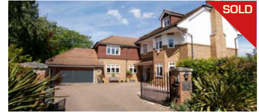
Bathgate Road, Wimbledon £3,325,000