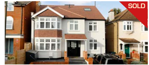
Dora Road, Wimbledon £2,850,000