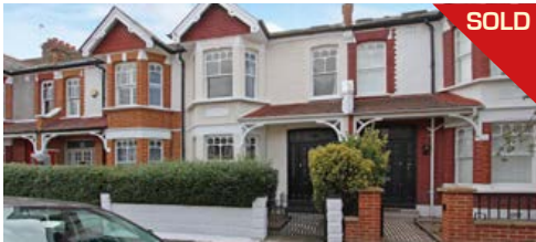
Ashen Grove, Wimbledon £1,000,000