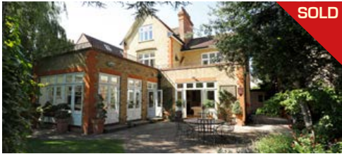
Ridgway Gardens, Wimbledon Village £4,650,000