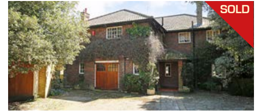
Coach House Lane, Wimbledon £3,450,000