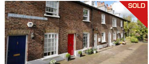
Church Road, Wimbledon Village £1,175,000