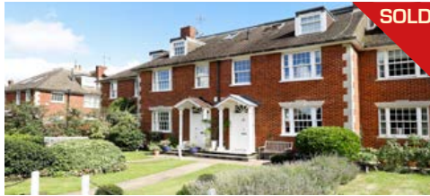
Old House Close, Wimbledon Village £2,250,000