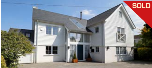
Seymour Road, Wimbledon £3,250,000